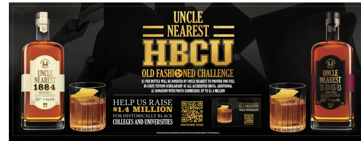
LARGE CASE CARDS