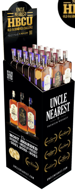
3 CASE CORRUGATE BINS